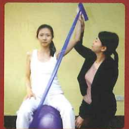
Back to Fitness