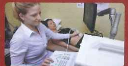
Imaging US & Pressure Biofeedback Guided Exercises