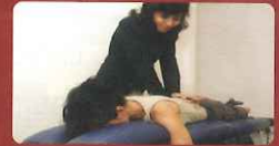
Assessment and Evaluation