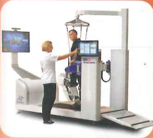
Robotics/Virtual Reality Trainer