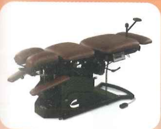
Mobilization/Manual Therapy Table